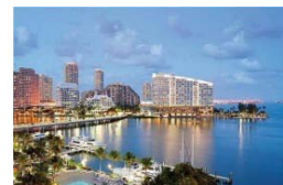
FLORIDA ICU, TELE, CATH LAB