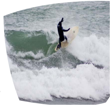
Surfing Lake Michigan

Wherever you turn, Milwaukee's rich cultural history is alive and ever present in the hustle and bustle of this modern metropolis.