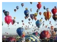
NEW MEXICO ER, ICU, MS