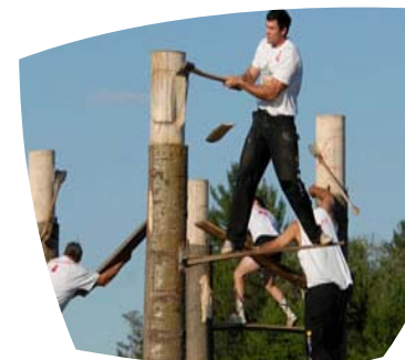
Lumbar Jack World Championship in Hayward