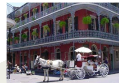
LOUISIANA L&D, PACU, OR, MS