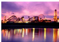
CALIFORNIA ER, ICU, PACU, OR