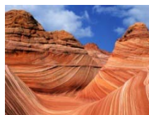
ARIZONA ER, ICU, TELE