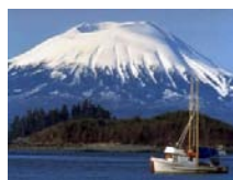
ALASKA ICU, OR, L&D