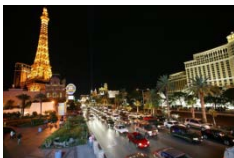
LAS VEGAS, NV ER, ICU, L&D, MS