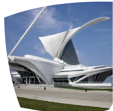
Milwaukee Art Museum